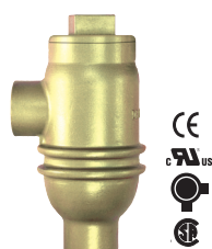
3/4" NPT Ports

LS-159000 Series – Low Cost, Compact Aluminum Housing